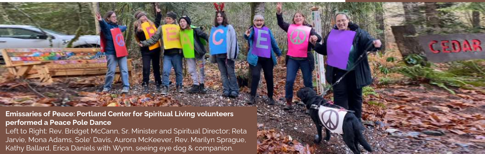
Emissaries of Peace: Portland Center for Spiritual Living volunteers performed a Peace Pole Dance

This inaugural holiday event provided our sponsors a unique opportunity to showcase their businesses and invest in our community. Their contributions helped Camp Cedar Ridge make this family-friendly holiday event accessible to everyone free of charge, ensuring that more families could enjoy the festivities, regardless of their financial situation.