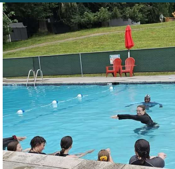
Swim lessons, 2024

Get ready for an exciting opportunity for young water safety enthusiasts! Our Jr. Lifeguard Certification Program is launching soon, offering hands-on training in lifesaving skills, water rescue techniques, and first aid. Designed for aspiring lifeguards, this program builds confidence, teamwork, and essential water safety knowledge – all while having fun in the water! Stay tuned for registration details and get ready to dive into a program that is preparing the next generation of lifeguards.