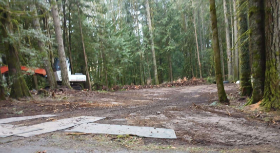
After the logging, clearing and leveling

To each of you, we extend our deepest appreciation. Your logging expertise and hard work have not only expanded our parking capacity but also enhanced the beauty and accessibility of our space. Thank you for being an integral part of this transformation!