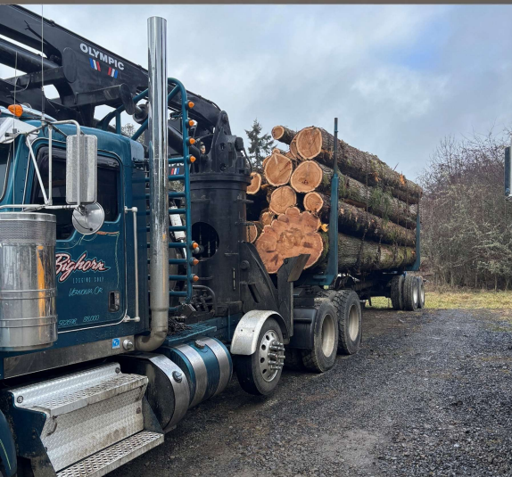
First of two loads of cedar trunks being transported