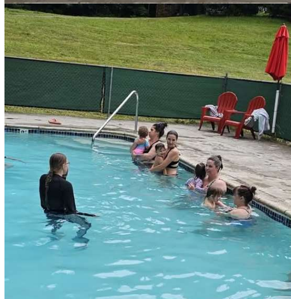
Parent and Me swim lessons, 2024