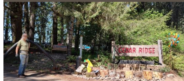
Diego Reyes, CCR Groundskeeper, creating planter at CCR Entrance