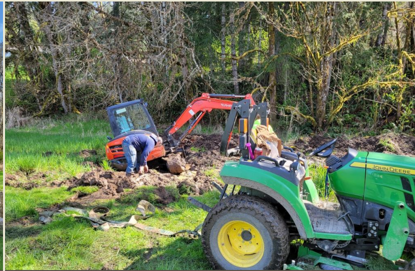
Ben Peltzer: A true act of neighbor-helping-neighbor generosity