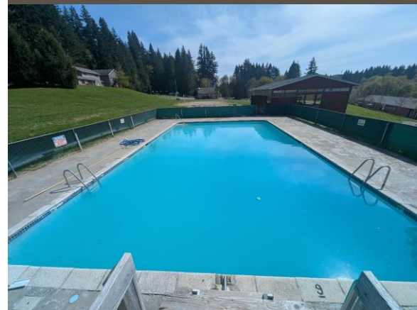
Pool is Ready for the Season!