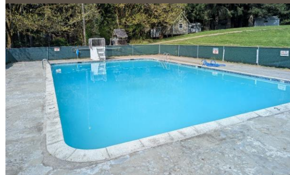
Pool Pump Upgrade