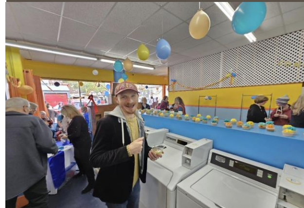
CCR Food Service delights attendees with cupcakes sporting frosting swirls in Loggin' Laundry color palette