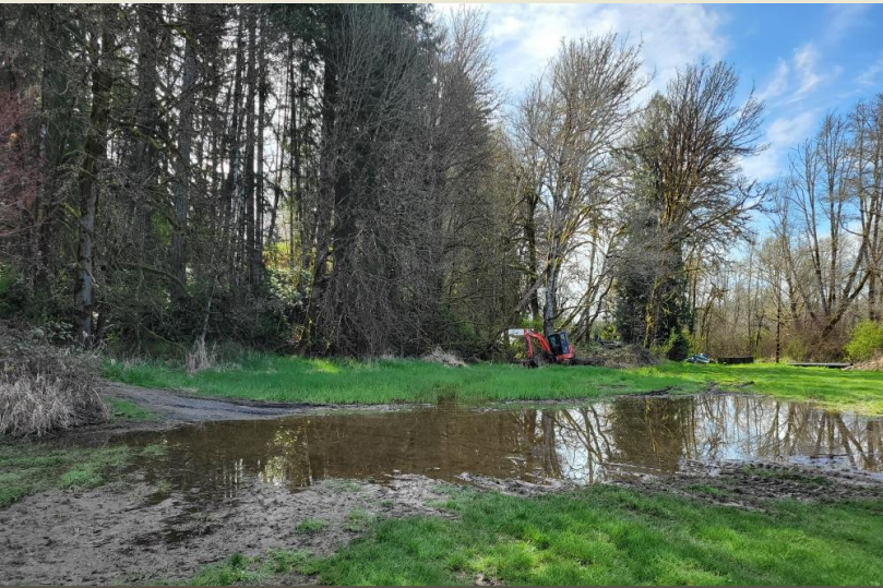
"Lake Cedar Ridge" before excavation