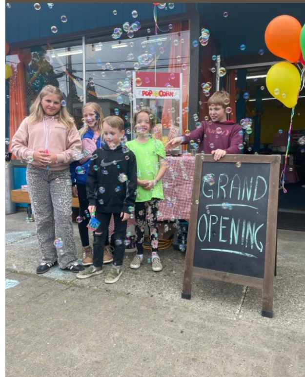
Vernonia Village attendees at the Grand Opening