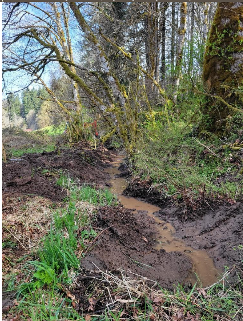
"Lake Cedar Ridge" has been drained!