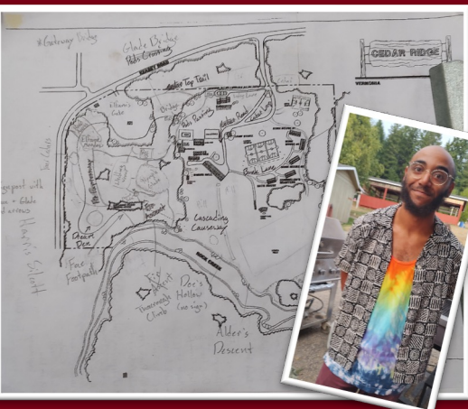
Work-in-progress draft of updated camp map created by Harris Silcott as part of an accessibility project, featuring detailed trails, landmarks, and plans for interpretive signage and historical context.