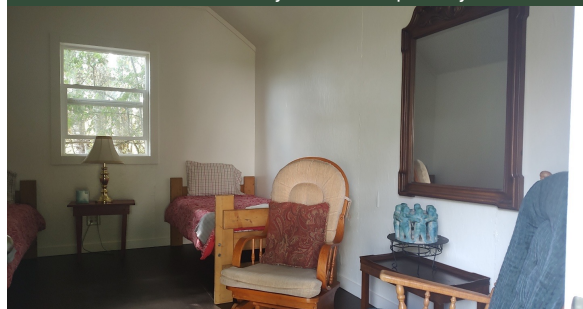
Cabin 4 ready for occupancy