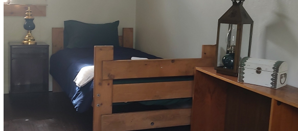
Cabin 2 ready for occupancy.