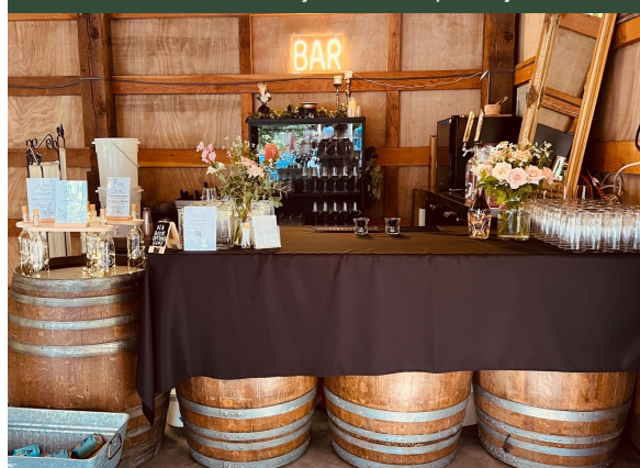
A welcoming front view of the refreshed Event Barn Bar.