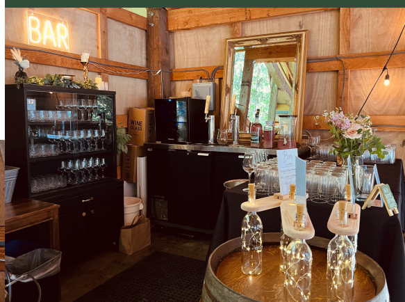
The Decorating Divas' vision brought to life — a stylish and welcoming bar space.