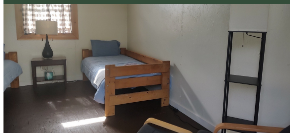
Cabin 3 ready for occupancy