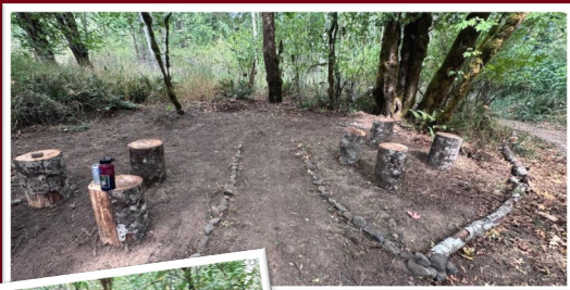
The Garden That Doesn't Ask—an intimate, contemplative space near the creek, created by Solé Davis .