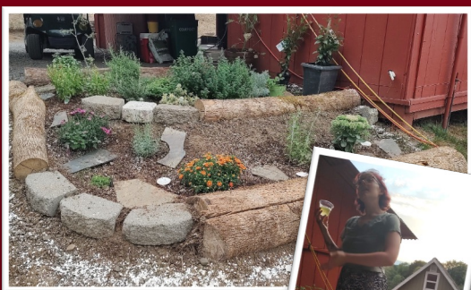
New herb garden tier designed by Jayden Parsons , featuring selected herbs and natural landscaping.

Looking ahead, he proposed a longer-term expansion of the project: designing, constructing, and installing new signs to clearly mark key locations; compiling historical context of the camp, developing a self-guided walking trail with narrative stops, and working toward the production of a professionally printed map for use by campers, visitors, and program leaders.